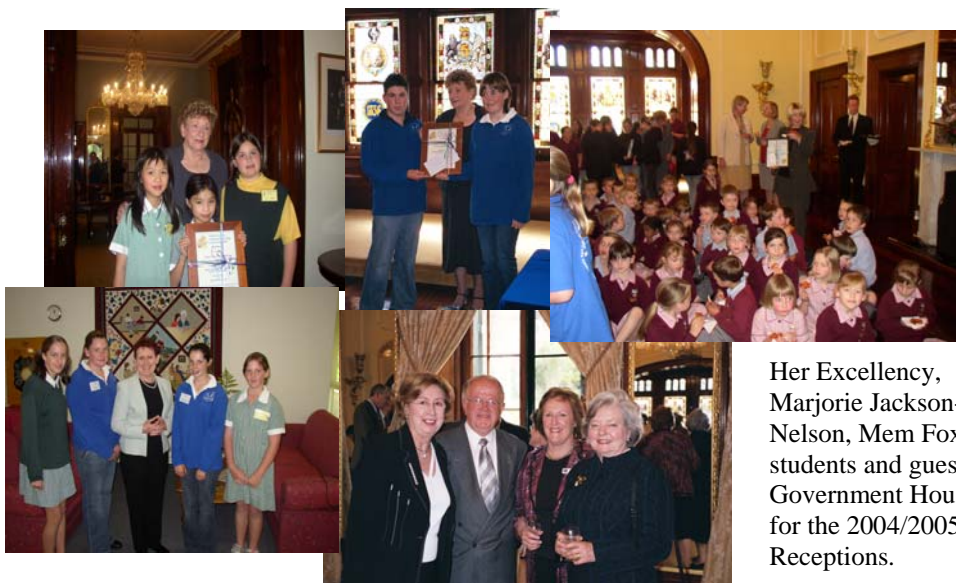
Her Excellency, Marjorie Jackson-Nelson, Mem Fox, students and guests at Government House for the 2004/2005 Receptions.

The scholarship is named after Mem Fox's book Wilfrid Gordon McDonald Partridge.