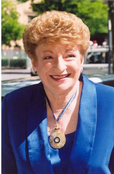
Her Excellency, Marjorie Jackson-Nelson, AC, CVO, MBE Governor of South Australia